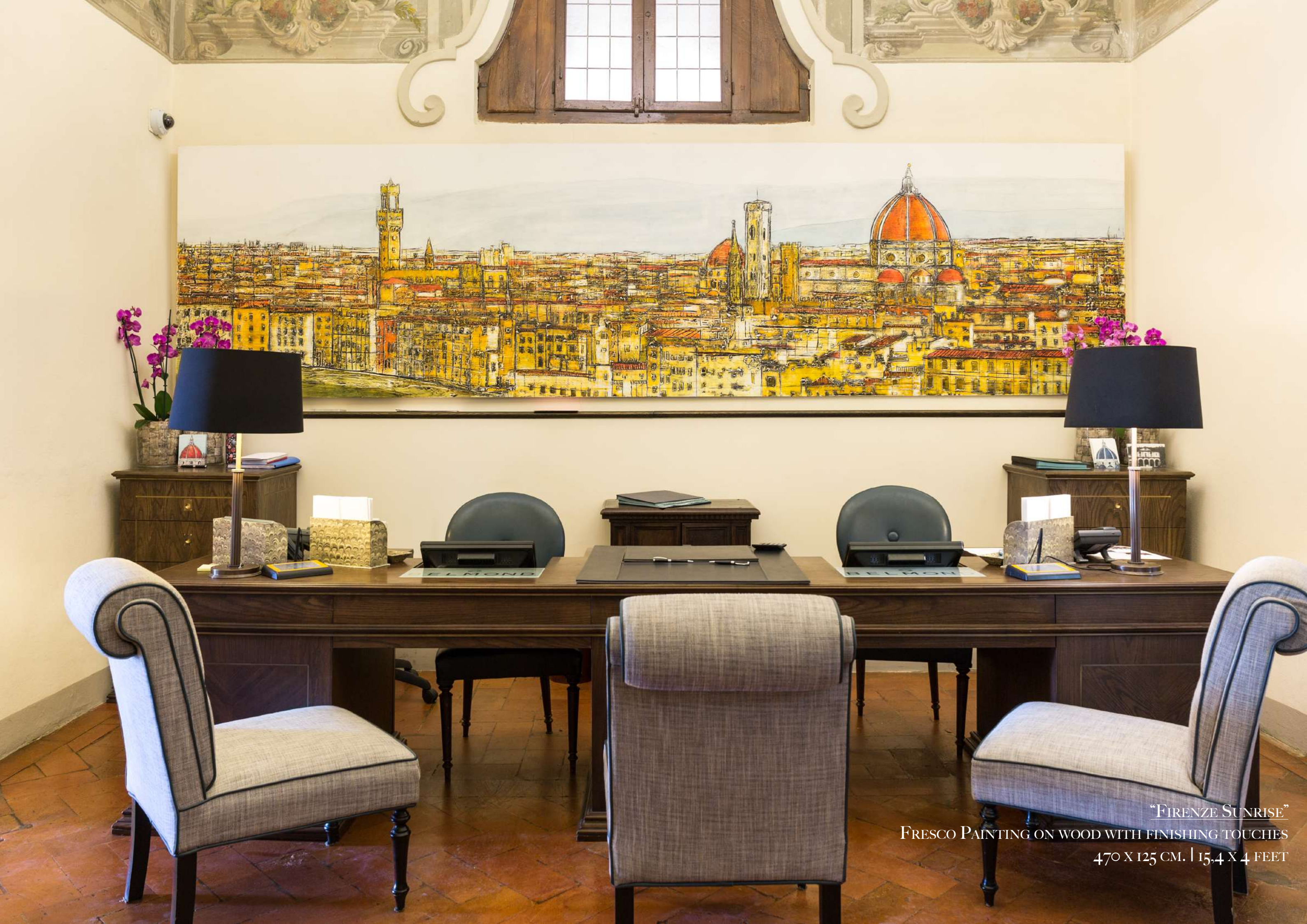
"FIRENZE SUNRISE" FRESCO PAINTING ON WOOD WITH FINISHING TOUCHES 470 X 125 CM. | 15,4 X 4 FEET