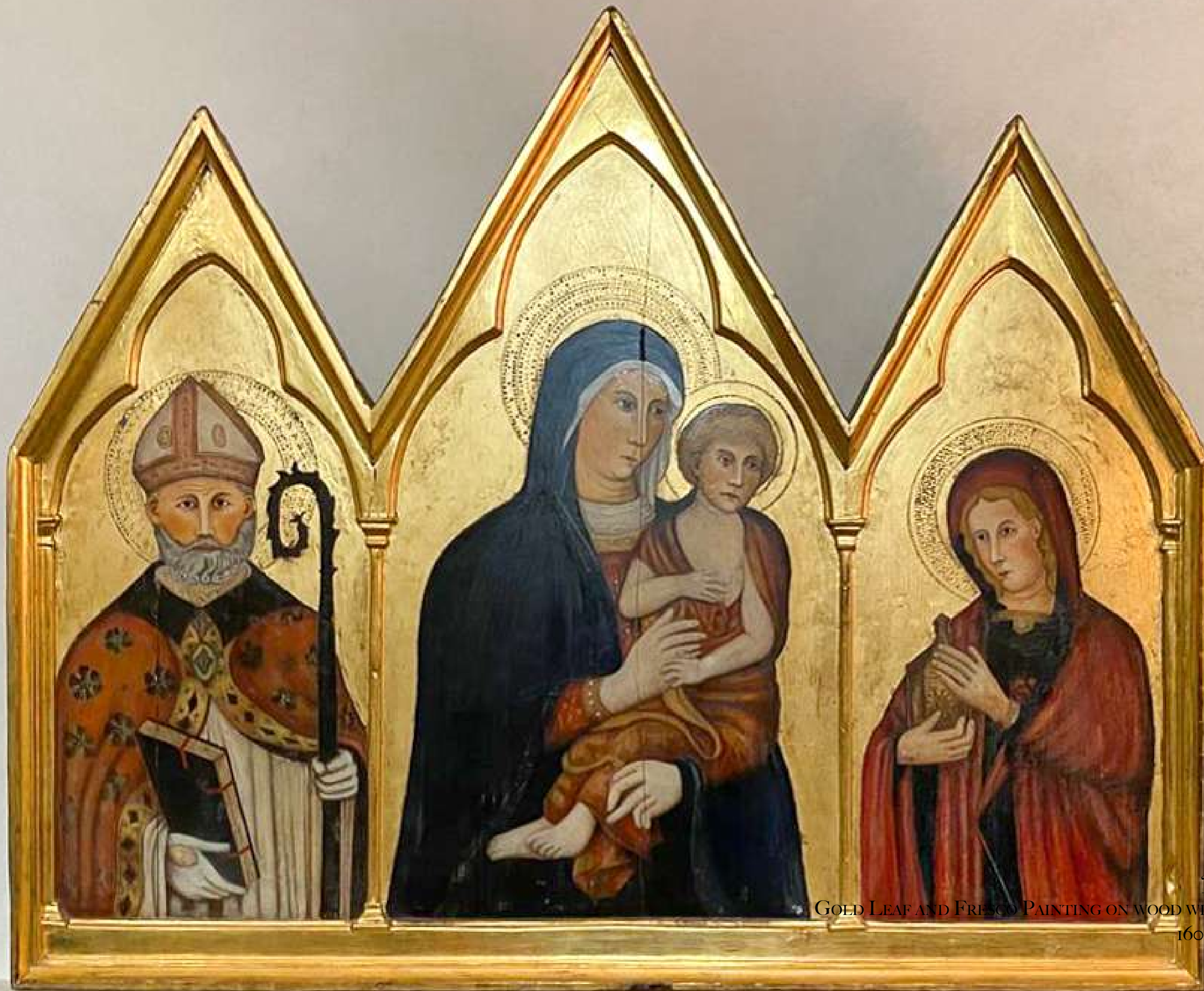
"GOLD POPPIES" DETAIL GOLD LEAF AND FRESCO PAINTING ON WOOD WITH FINISHING TOUCHES 160 X 200 CM | 63 X 78 INCH