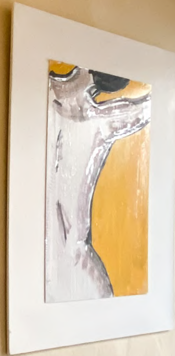
“WHITE POPPIES VERTICAL” FRESCO PAINTING ON WOOD WITH FINISHING TOUCHES 80 X 160 CM. | 31 X 62 INCH.