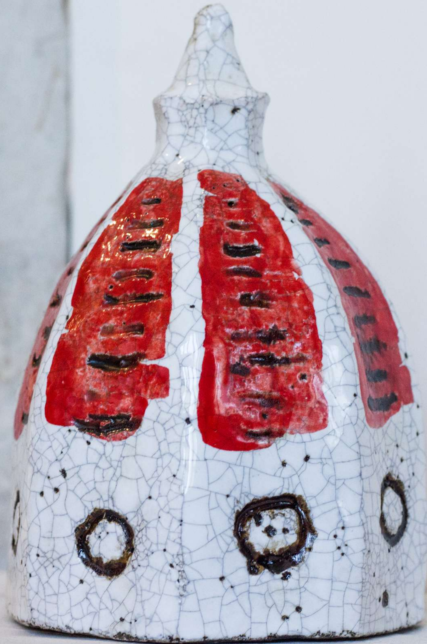
“CUPOLINE” CERAMIC PAINTING