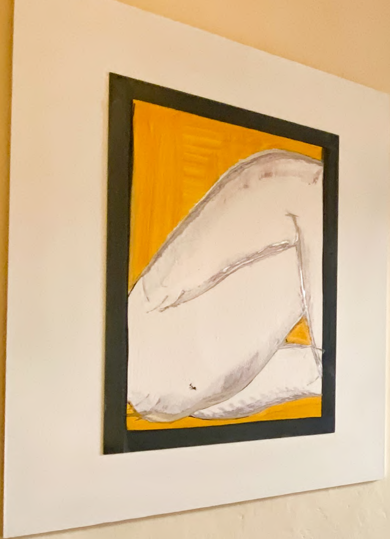
“VILLA SAN MICHELE B & W” FRESCO PAINTING ON WOOD WITH FINISHING TOUCHES 91 X 187 CM. | 35,8 X 73,6 INCH