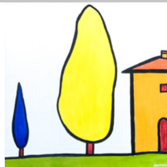
C Y P R E S S