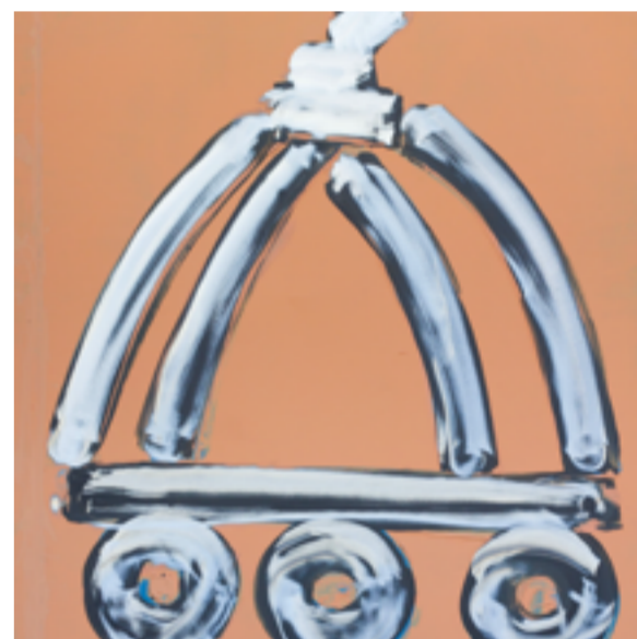
G R A F F I T O