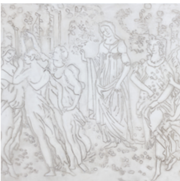
M A S T E R