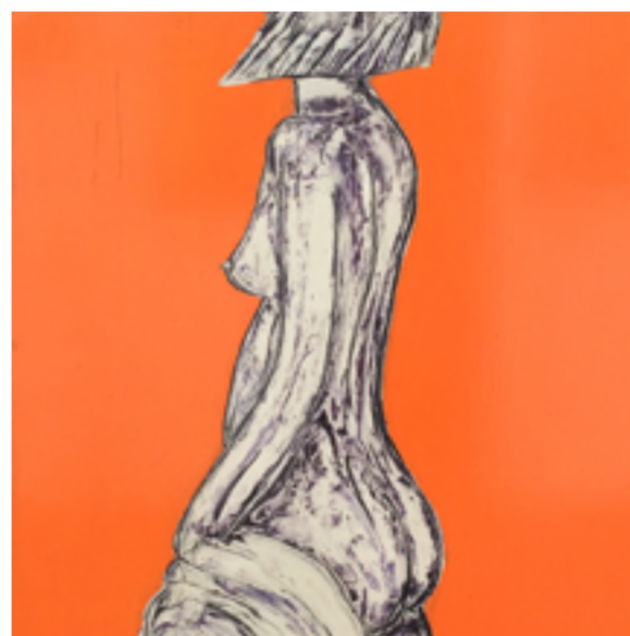
N U D E S