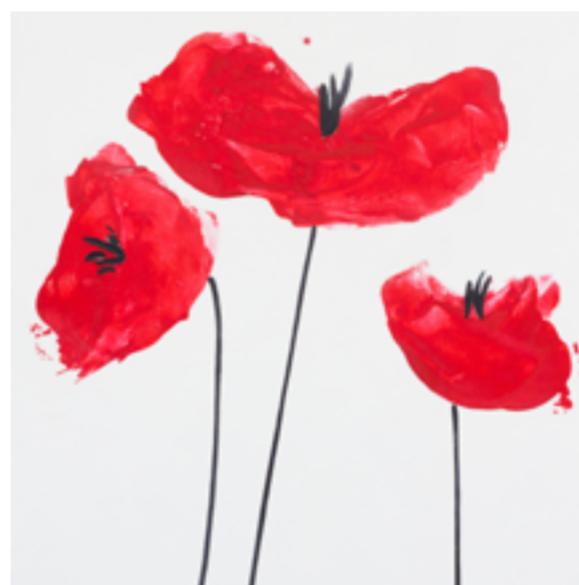
F L O W E R S