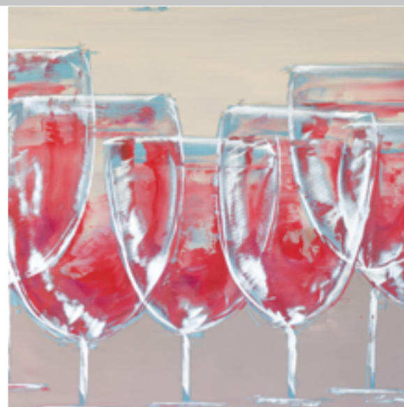
C H A L I C E S