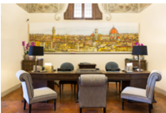
BELMOND VILLA SAN MICHELE