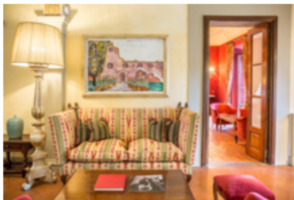
VILLA LA MASSA

LUNGARNO DEGLI ACCIAIUOLI 4, 50123, FLORENCE