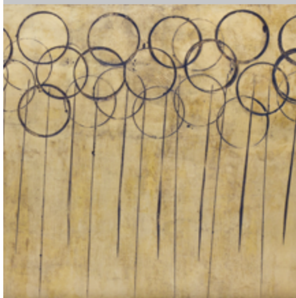
A B S T R A C T