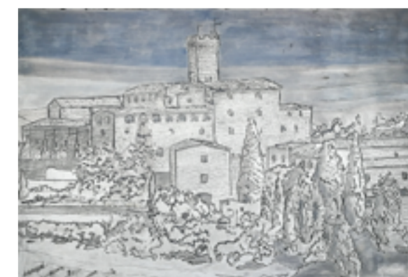
CASTELLO BANFI - IL BORGO

CASTELLO DI POGGIO ALLE MURA, 53024 MONTALCINO SIENA