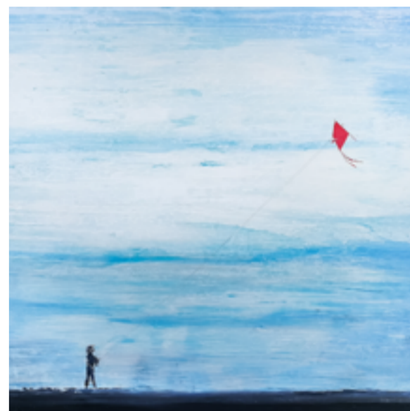
O C E A N