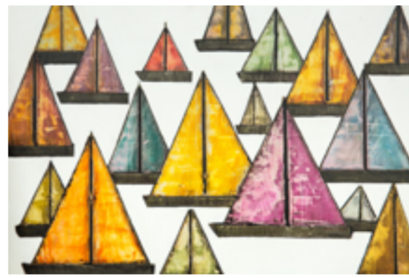
BELMOND HOTEL CIPRIANI

VIA DELLA MASSA, 24, 50012, CANDELI, FLORENCE