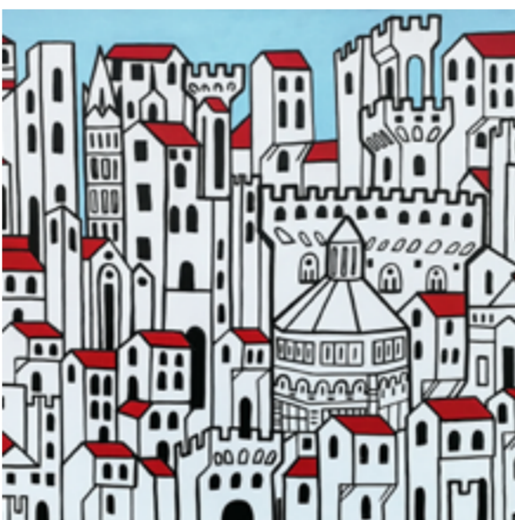
F L O R E N C E